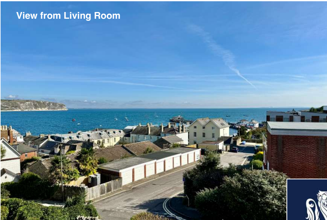
View from Living Room