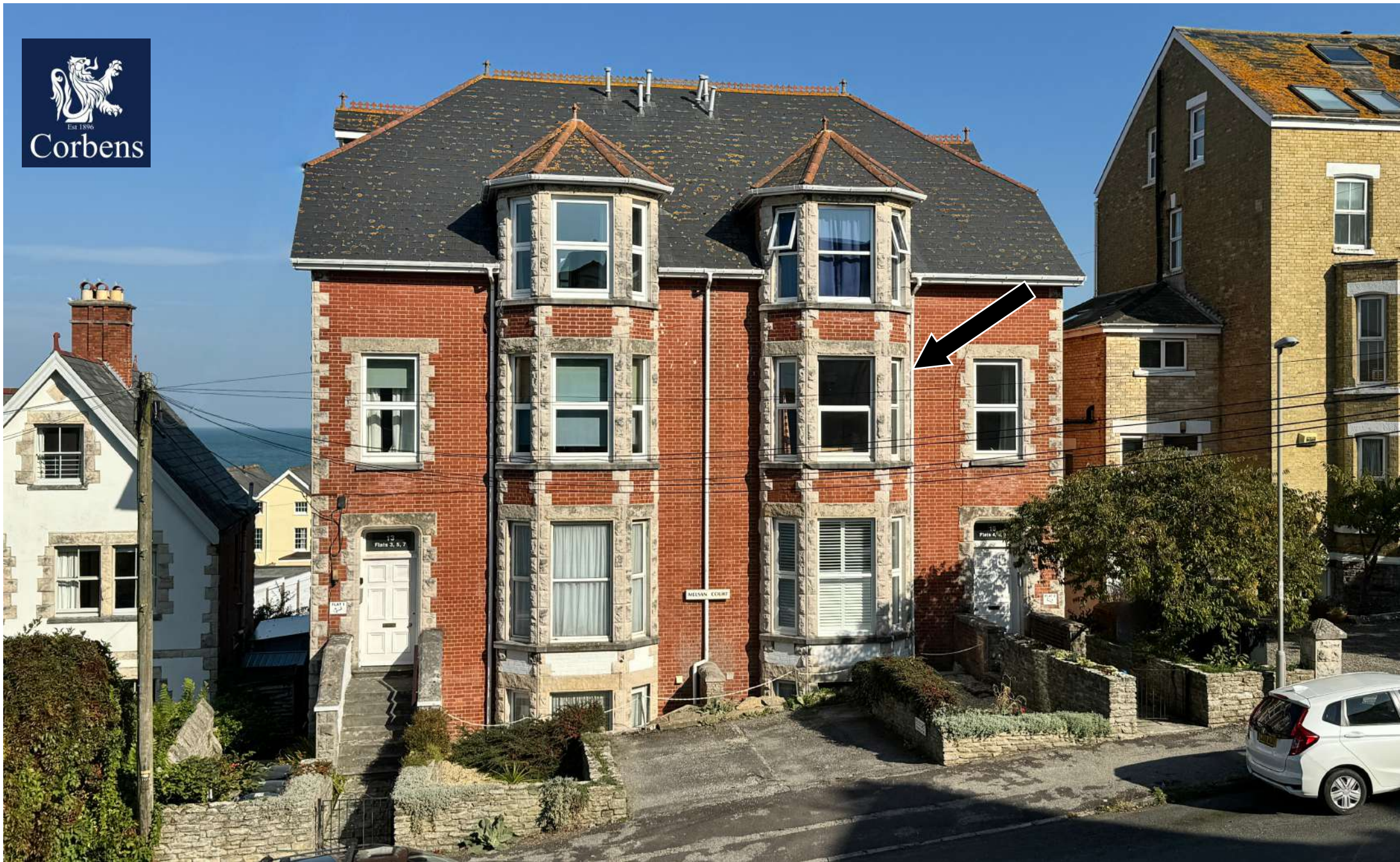
FLAT 6 MELSAN COURT, 13-15 PARK ROAD, SWANAGE £295,000 Shared Freehold