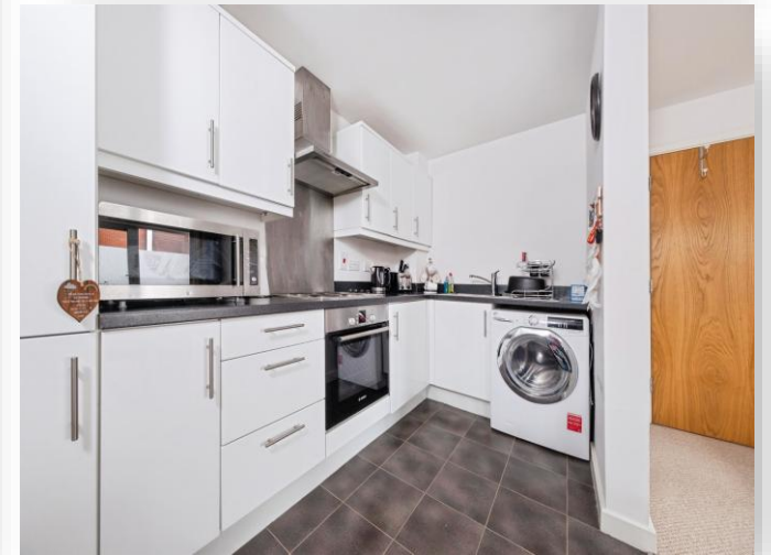
Addenbrookes Road, Newport Pagnell, MK16 9FD