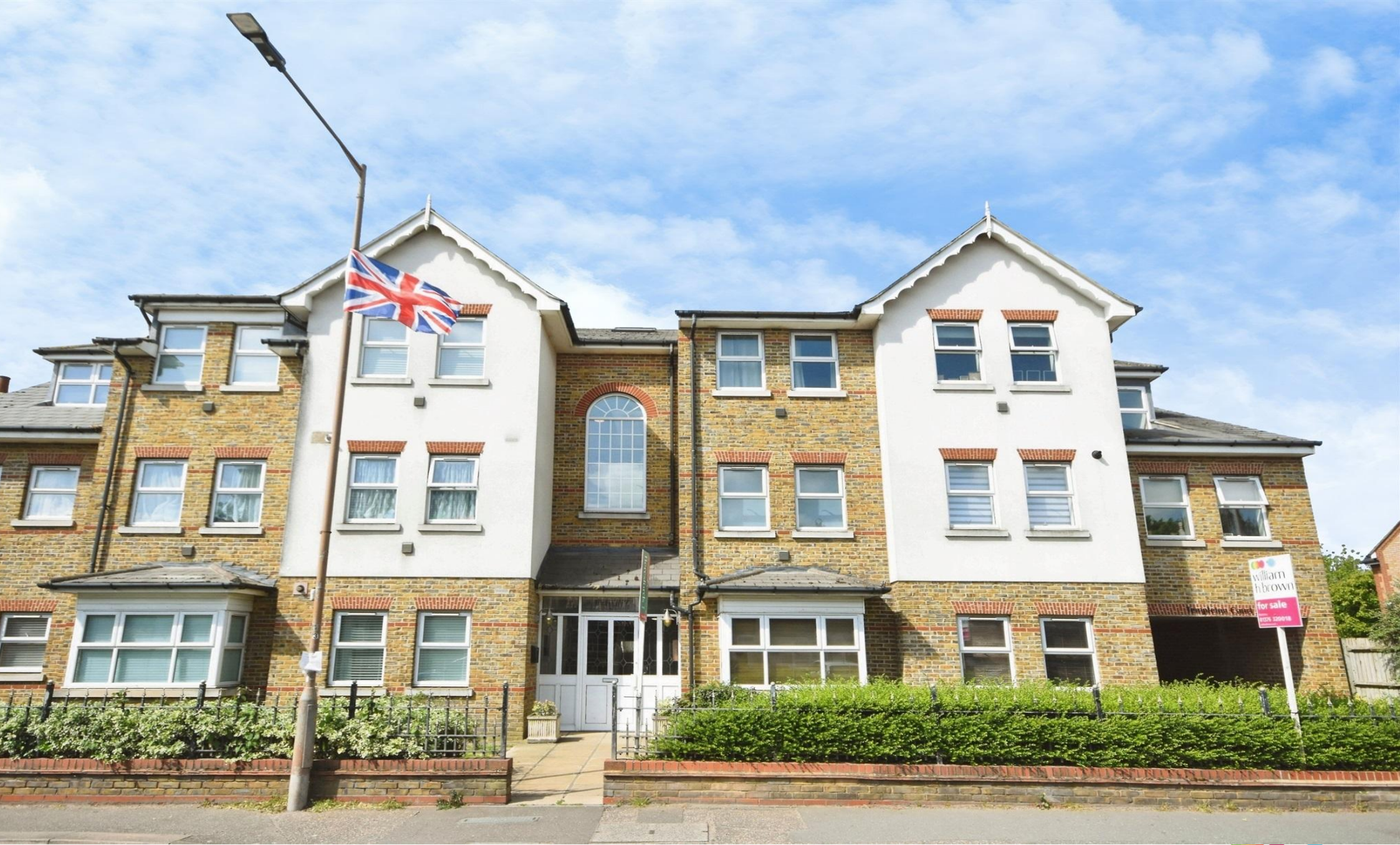
Templeton Court, Railway Street, Braintree, CM7 3JD