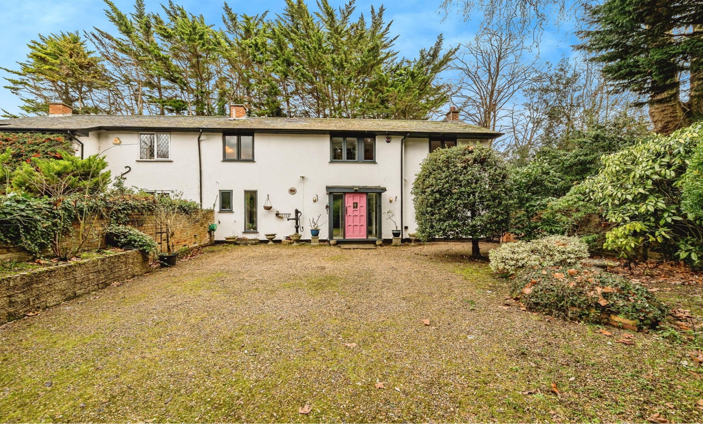
The Coach House Berry Hill, Taplow Maidenhead SL6 0DA