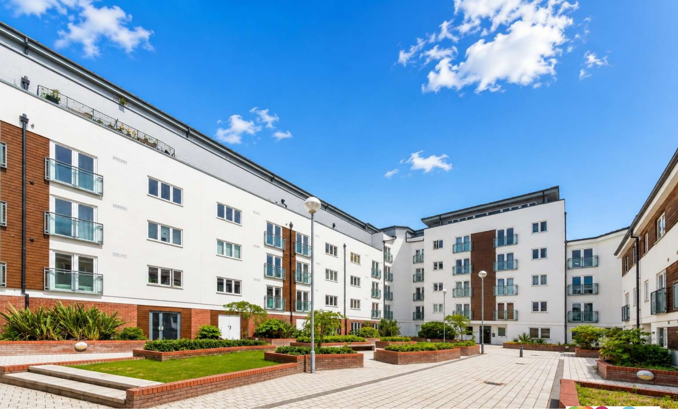
Stane Grove, London SW9 9AL