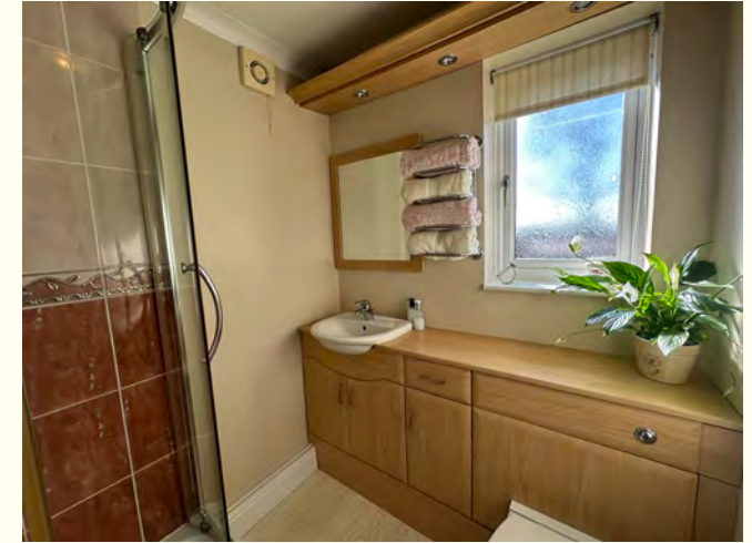
En Suite Shower Room