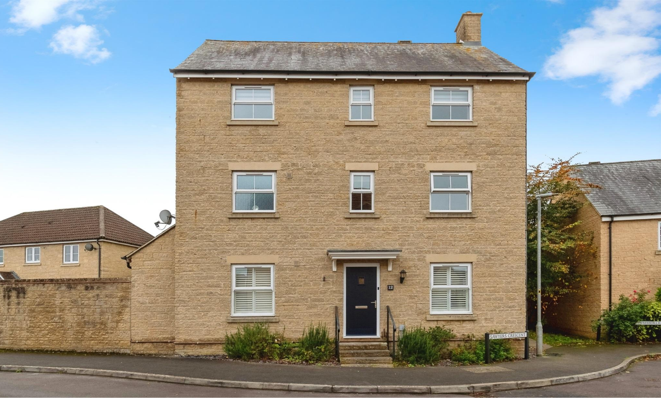
Sawyers Crescent, Corsham SN13 9EG