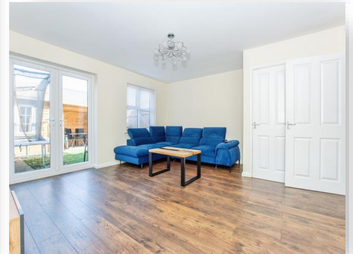
Fenmen Place, Wisbech PE13 3FA