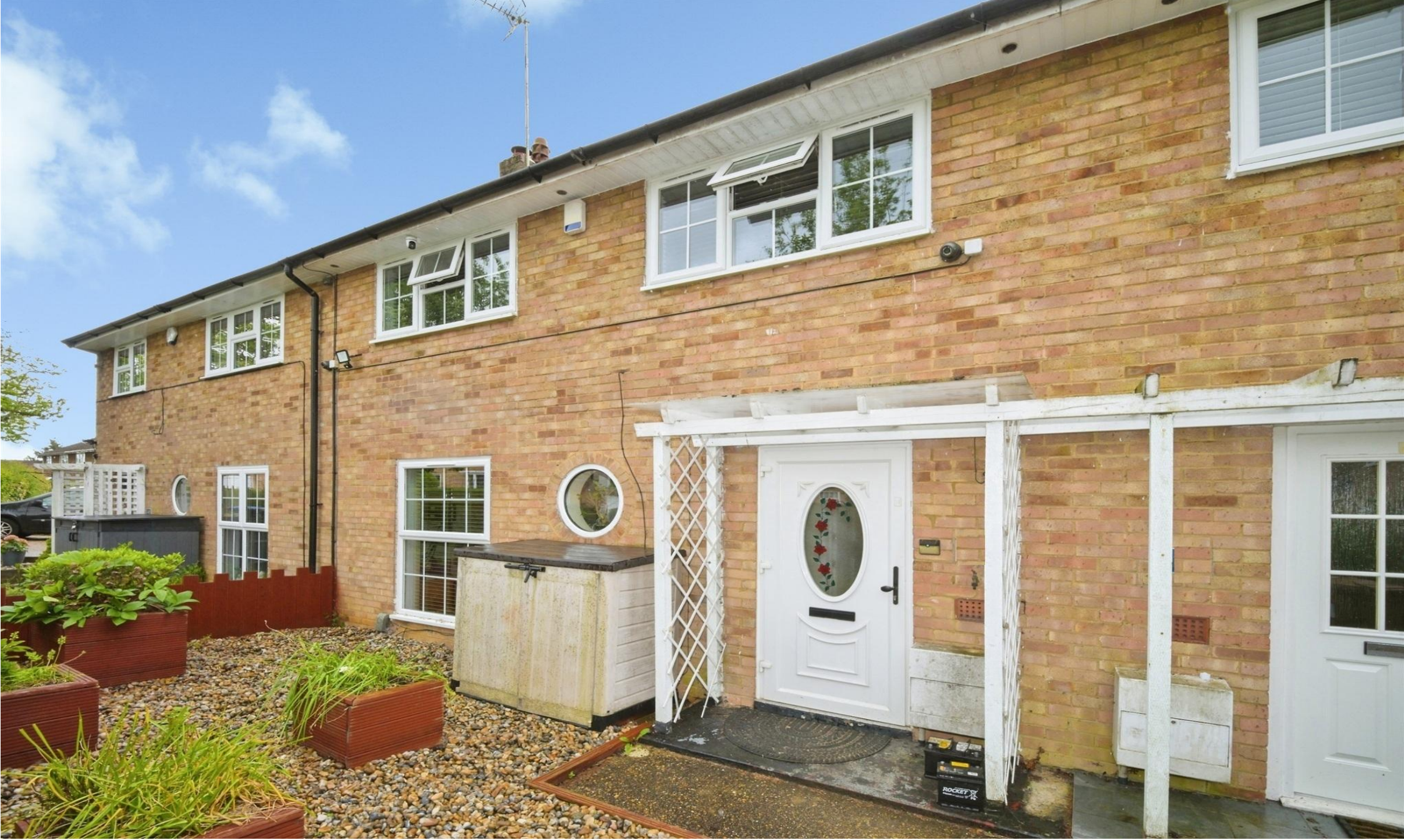
The Commons, Welwyn Garden City AL7 4RZ