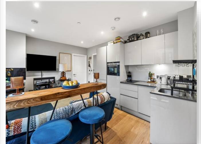
Mauger Heights, Summerstown, London SW17 0GZ