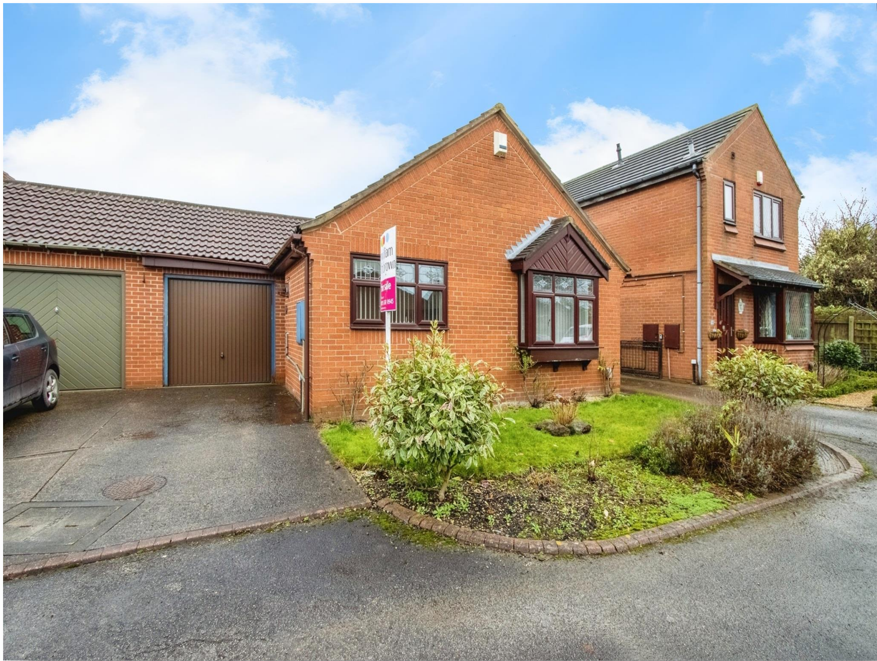
Burr Tree Drive, LEEDS LS15 9ED