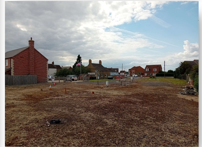
Marshall Court Skirth Road, Billingham Lincoln LN4 4AZ