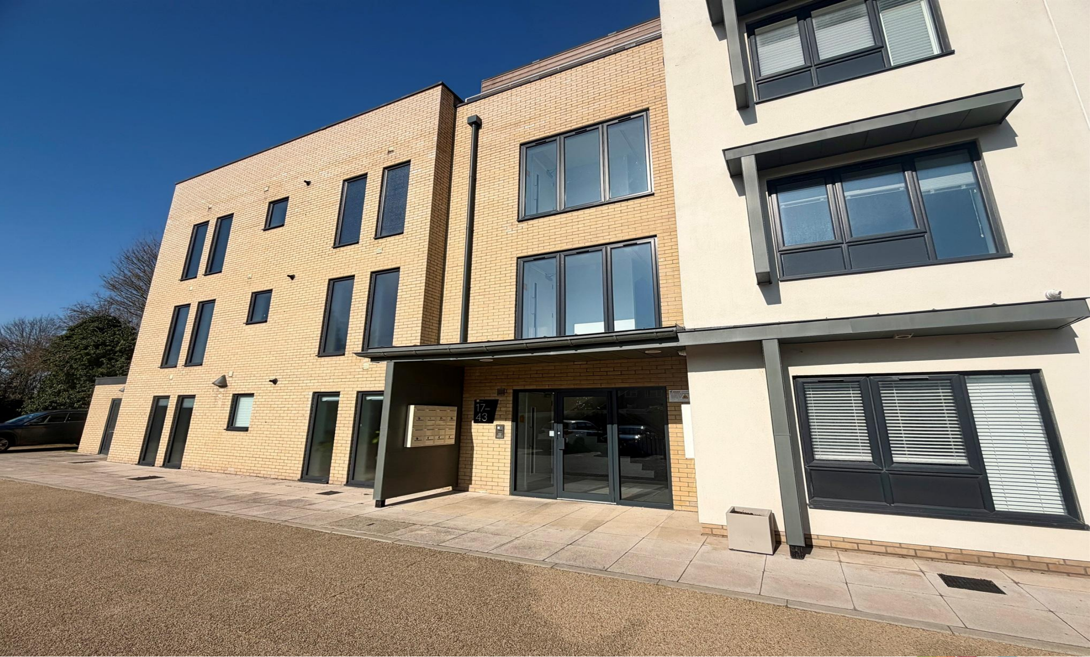
Waltham Glen, Moulsham Lodge Chelmsford CM2 9EL