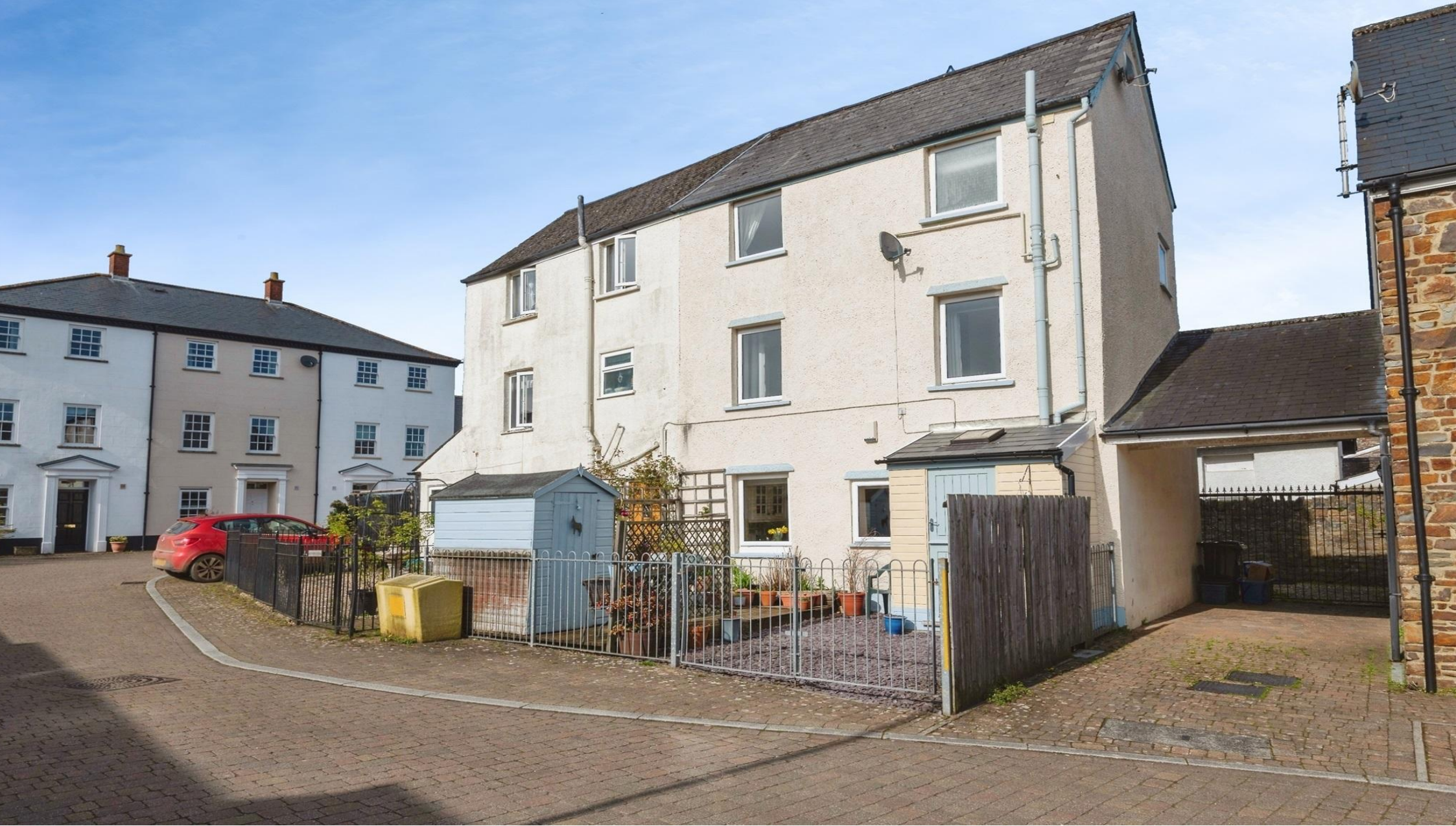
Rose Cottage Newton Square, Bampton Tiverton EX16 9NE