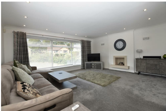
Lounge 17'8" x 15'8" (5.41m x 4.78m )

Two Upvc double glazed windows, two central heating radiators and contemporary wall mounted fire.