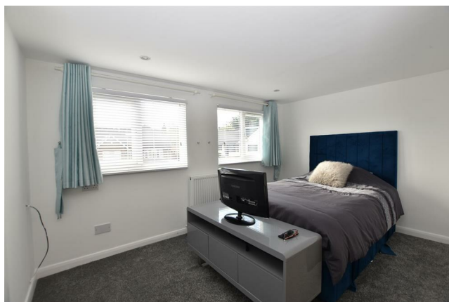
Bedroom Three 12'0" x 8'7" (3.66m x 2.64m )

Two Upvc double glazed windows to the front elevation, central heating radiator and fitted wardrobe.