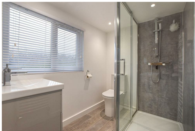
En-Suite 6'7" x 5'2" (2.03m x 1.60m )

Upvc double glazed window to the rear elevation, central heating radiator, partly tiled to splashback areas, storage in the eaves, cushion flooring and fitted with a three piece suite comprising walk in enclosure with mixer shower, vanity sink with mixer taps and low flush W.C.