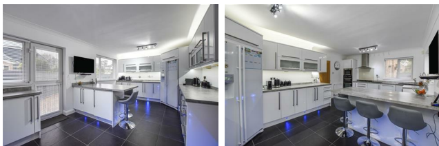
Kitchen / Diner 20'11" x 12'0" (6.38m x 3.66m )

Upvc double glazed door leading to the rear external with side window, two Upvc double glazed windows, central heating radiator, tiled flooring and fitted with a range of white floor and eye level units, contemporary worktops with splashback tiles above, sink with mixer tap, breakfast bar and a host of integrated appliances including double oven and microwave, hob with extractor hood above, two fridges, washer / dryer and American fridge-freezer.