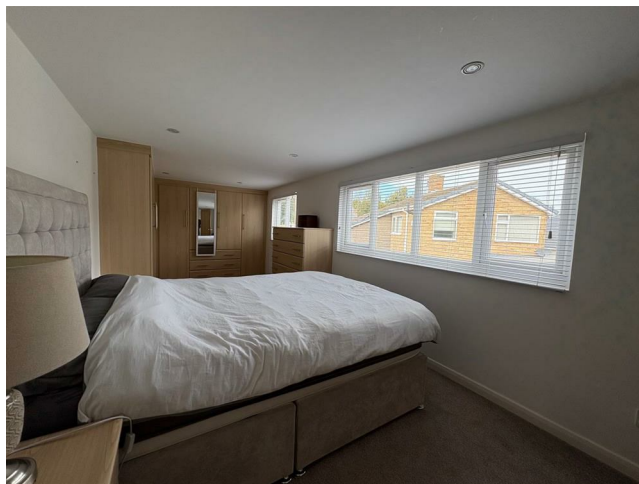
Bedroom One 20'6" x 8'2" (6.25m x 2.51m )

Two Upvc double glazed windows to the rear elevation, central heating radiator and fitted wardrobes.