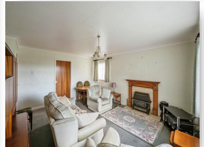
Corn Hill, Conisbrough Doncaster DN12 2BG