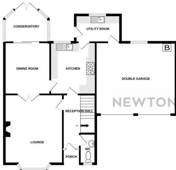
GROUND FLOOR 1161 sq.ft. (107.9 sq.m.) approx.