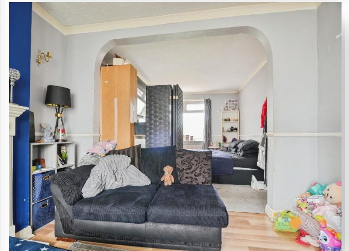
Malvern Road, Stockton-On-Tees TS18 4AU