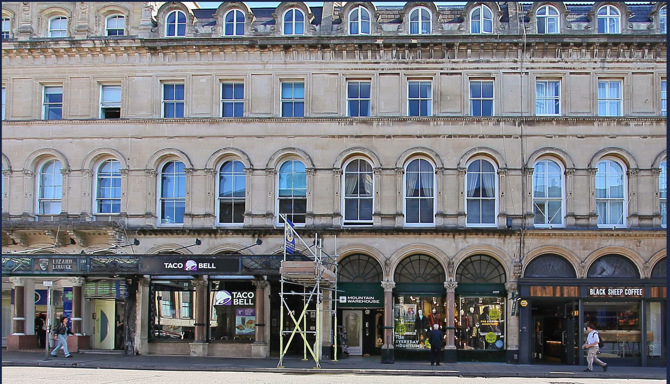
Flat 2, 62A Queens Road, Bristol