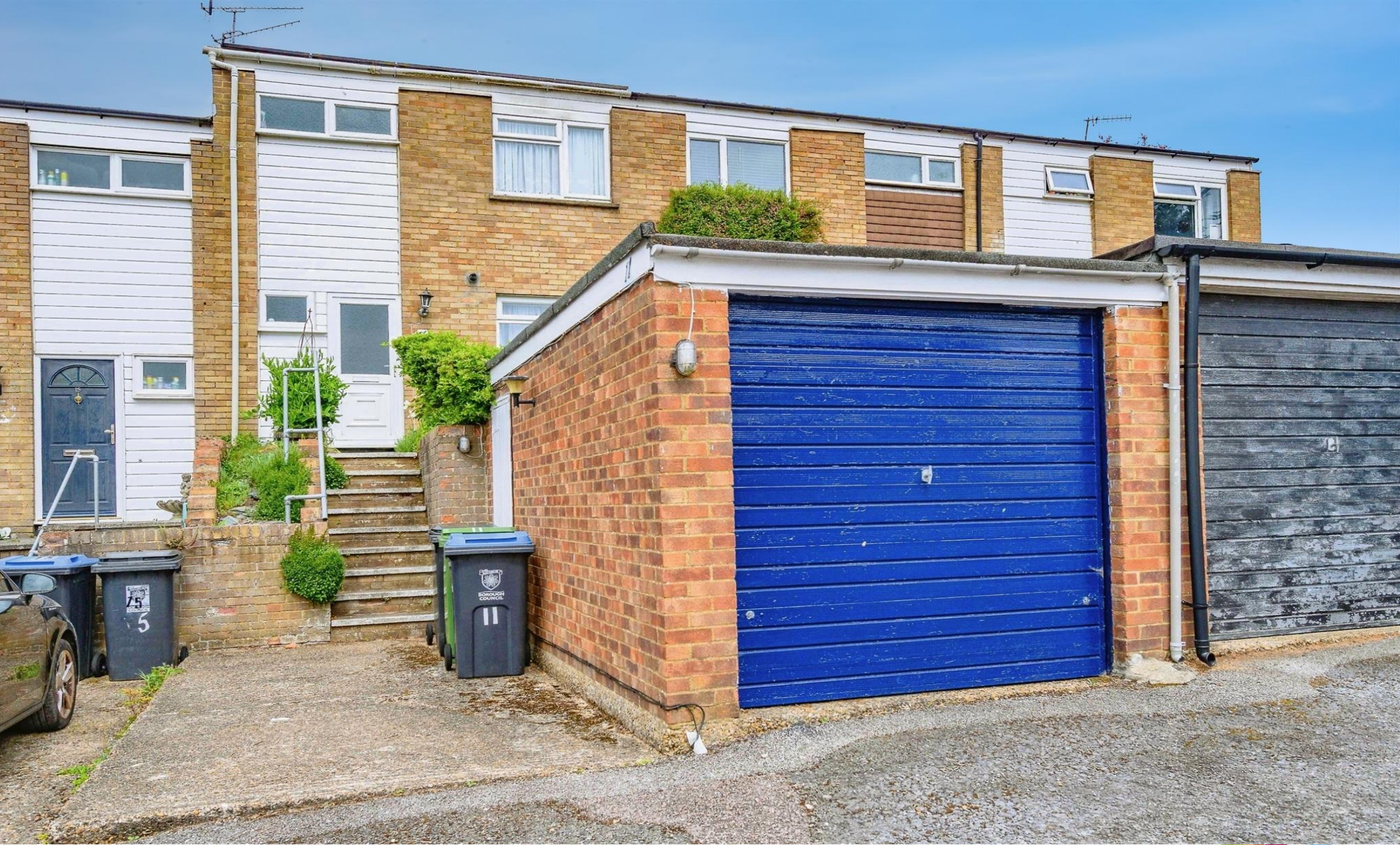
Brambling Rise, Hemel Hempstead HP2 6DT