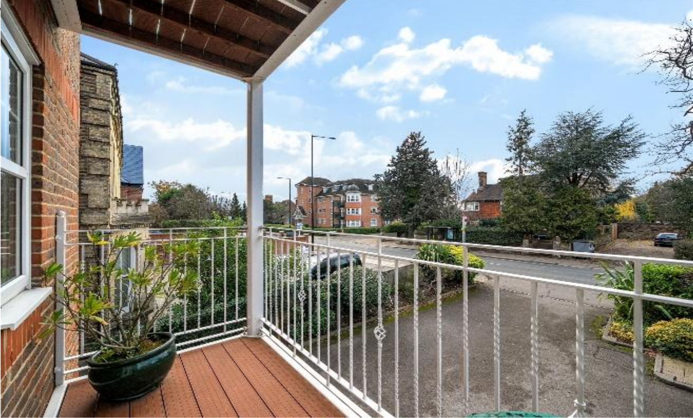
Langton Court, The Ridgeway, Enfield, EN2 8PD