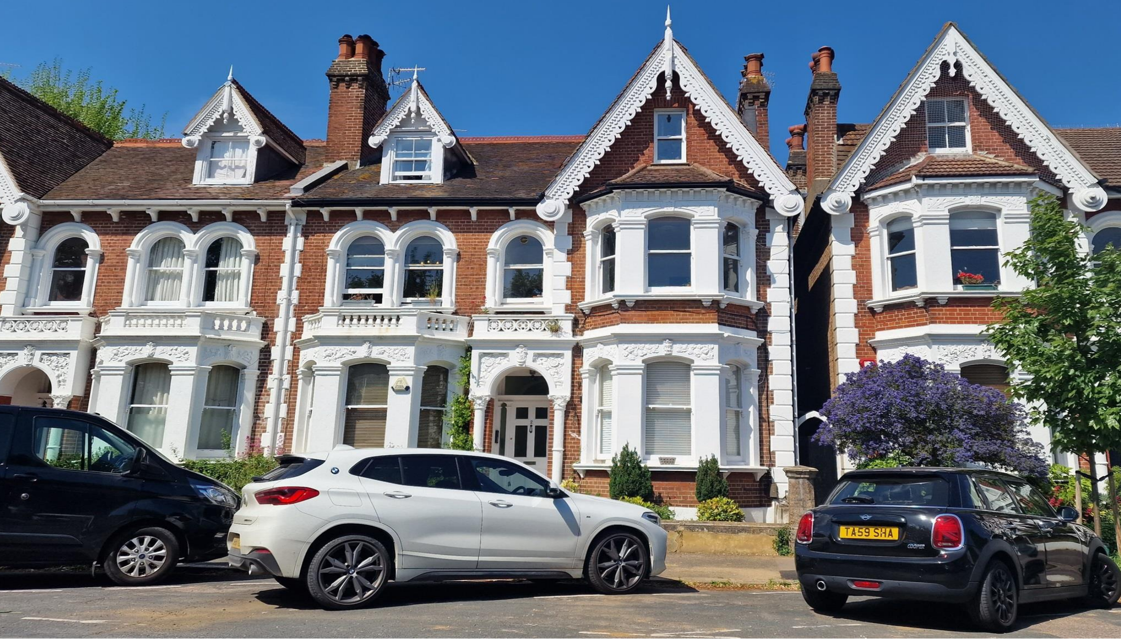
Eaton Villas, Hove BN3 3TB