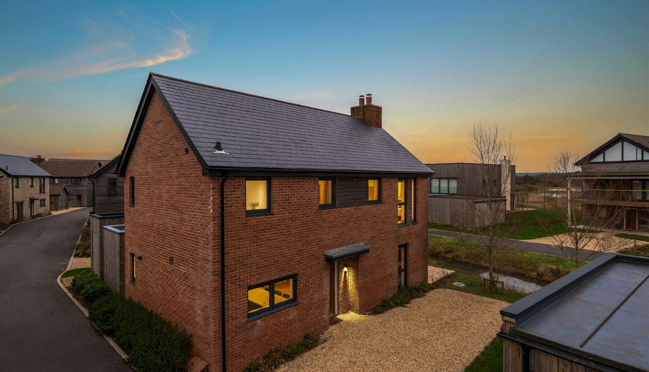
Brook Cottage, Wakeling Island Silverlake, Warmwell Road Crossways | | DT2 8GA