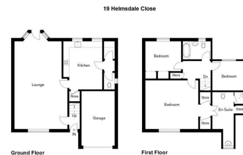
Illustration for identification purposes only, measurements are approximate, not to scale. (ip-ef404)