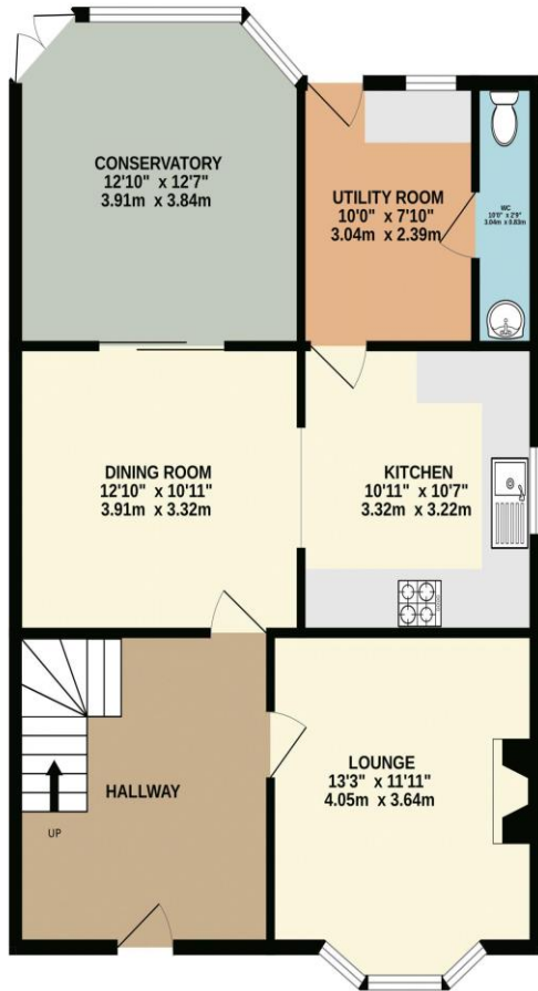
GROUND FLOOR 796 sq.ft. (73.9 sq.m.) approx.