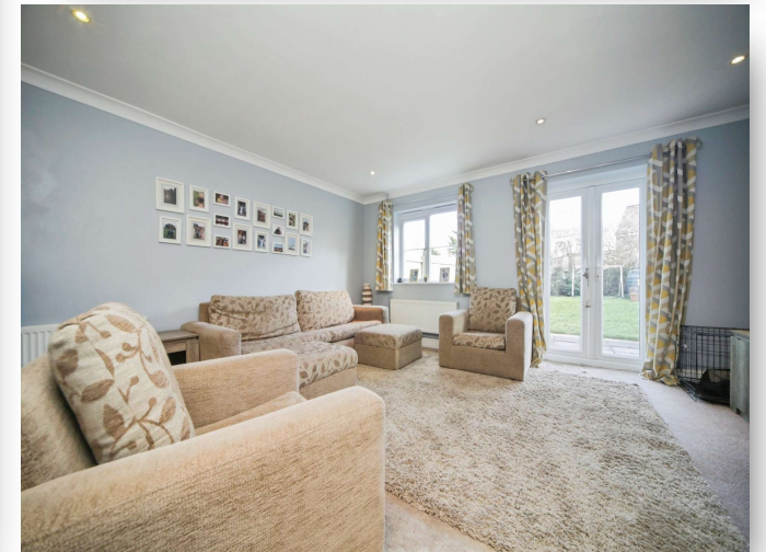
Highland Cottages, Church Road, Old Newton, STOWMARKET, IP14 4ED