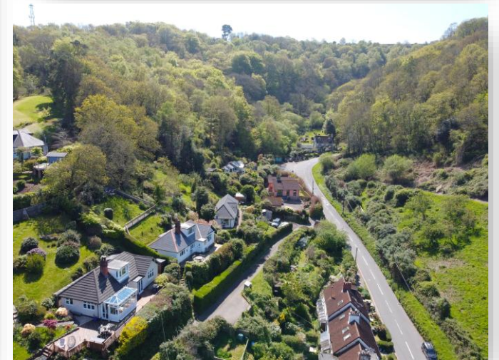
West Wind, Redway, Porlock, TA24 8QQ