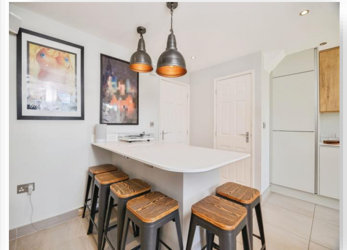
Barberry, Coulby Newham Middlesbrough TS8 0WB