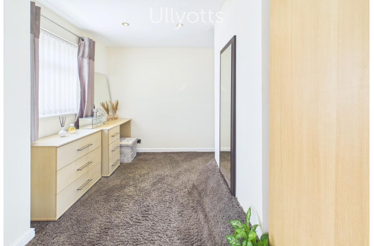
Master Bedroom Dressing Area

The first-floor landing provides access to three bedrooms and the family bathroom.