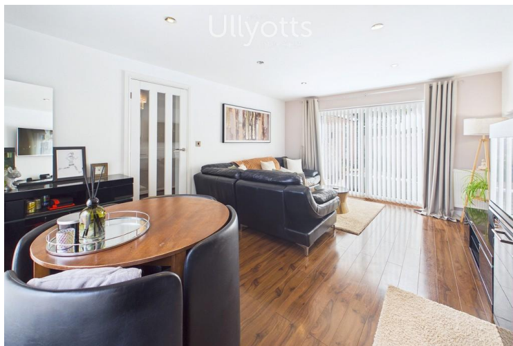
Sitting Room / Bedroom 4