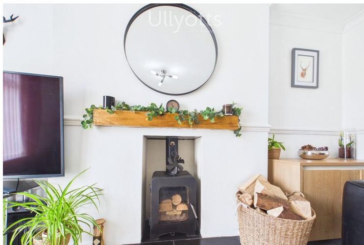
Lounge - LogBumer