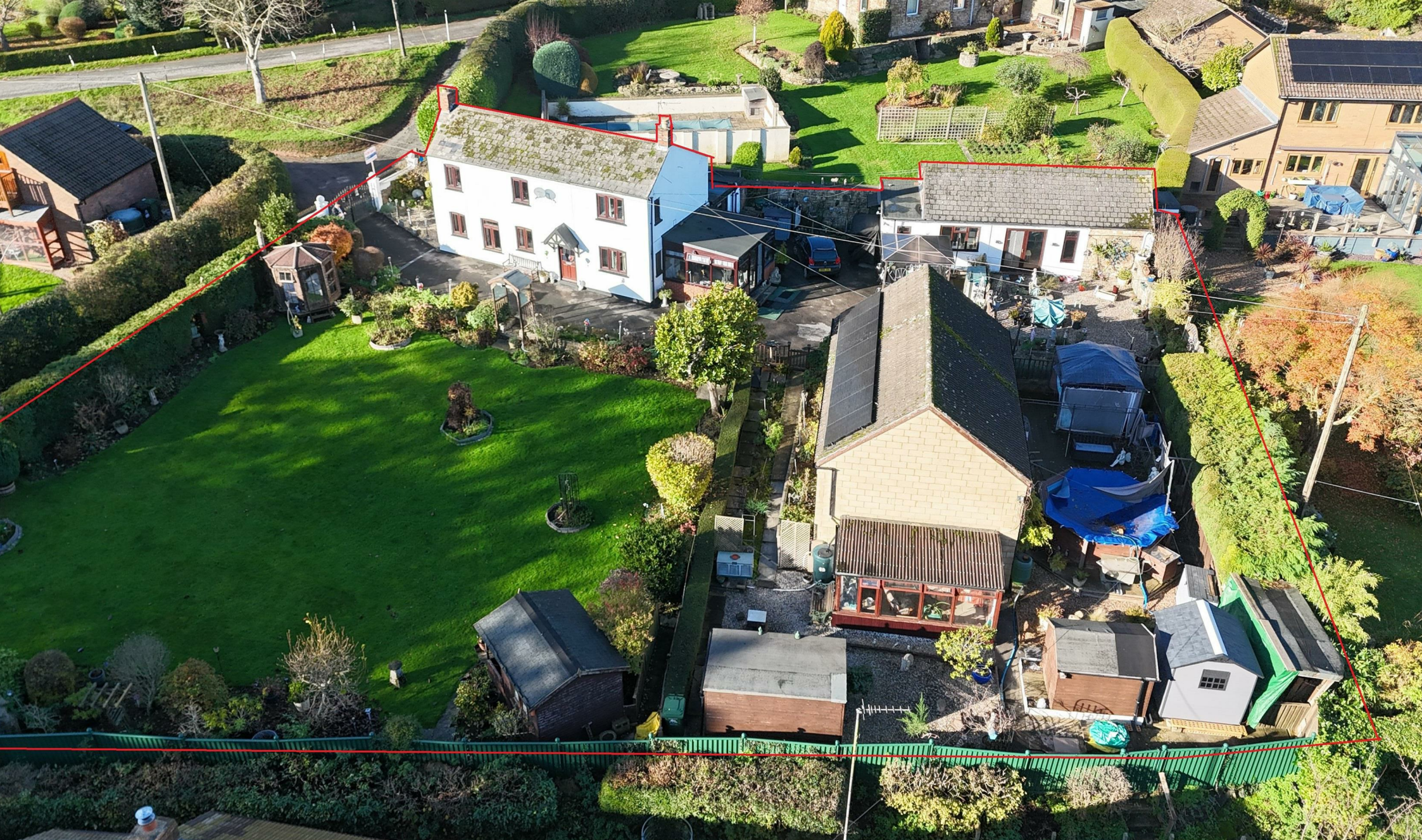
Ivy House Cliffords Mesne, Newent GL18 1JT