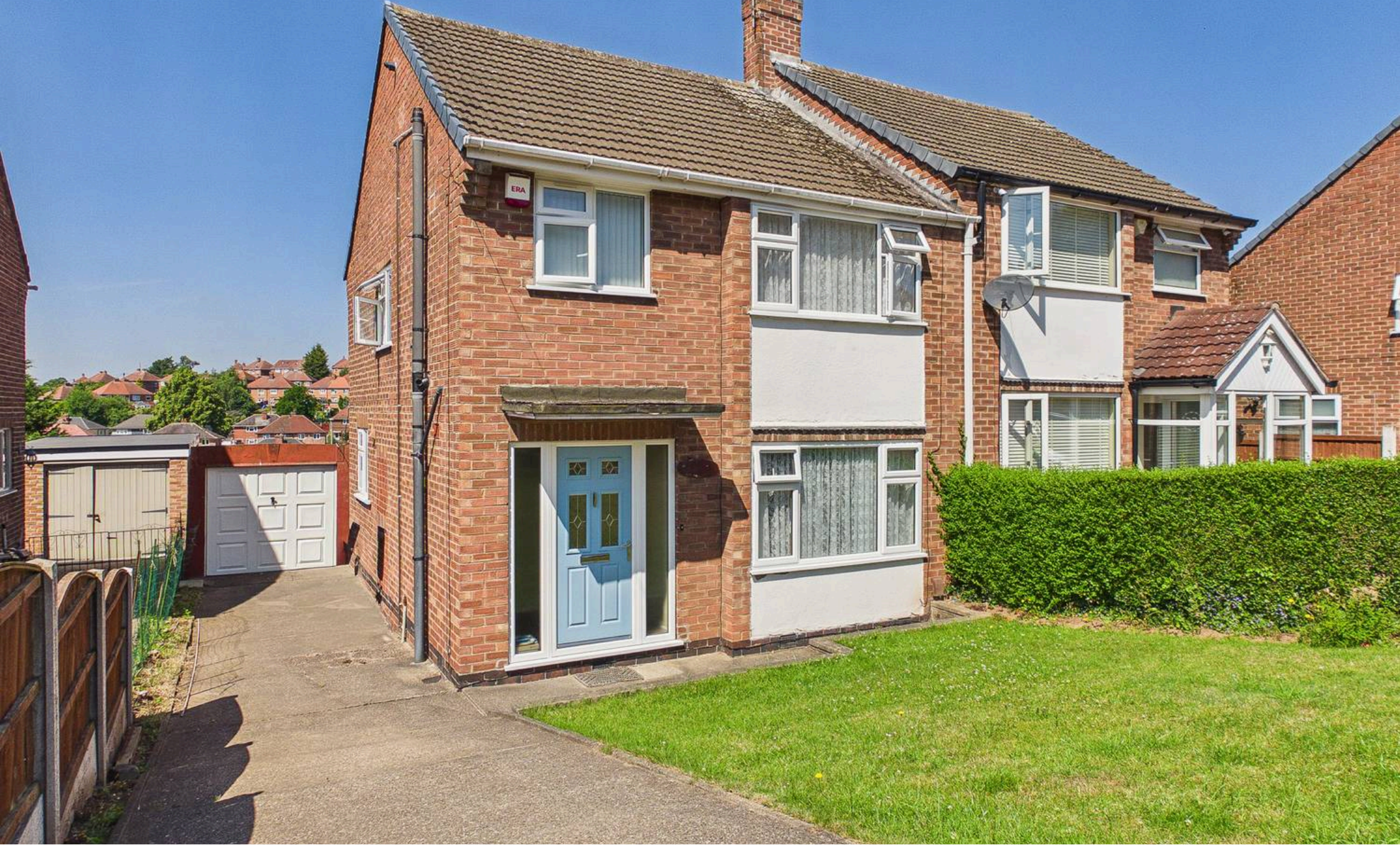
58 South View Road, Carlton – NG4 3QL Guide Price £240,000