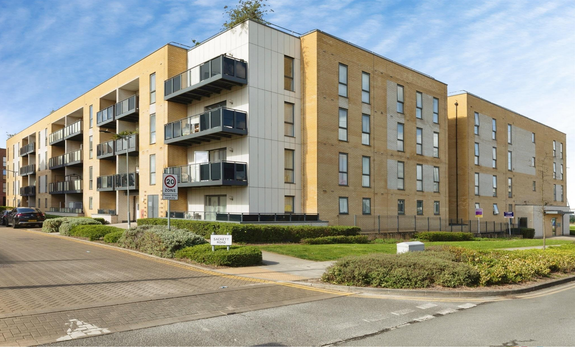
Dalton House, Handley Page Road, Barking, IG11 0UZ