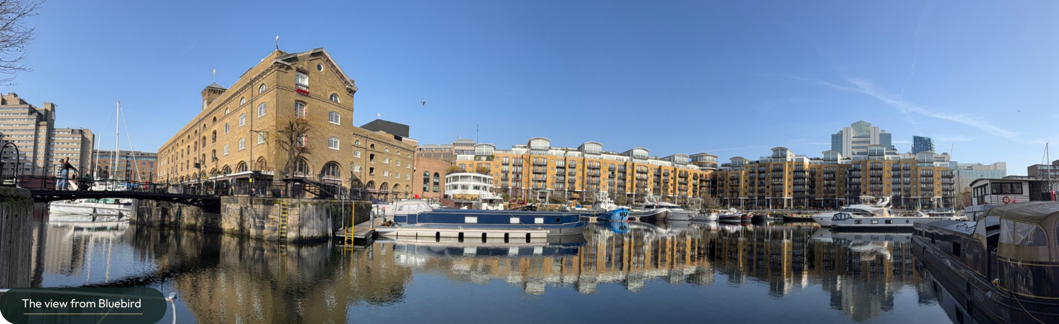
The view from Bluebird