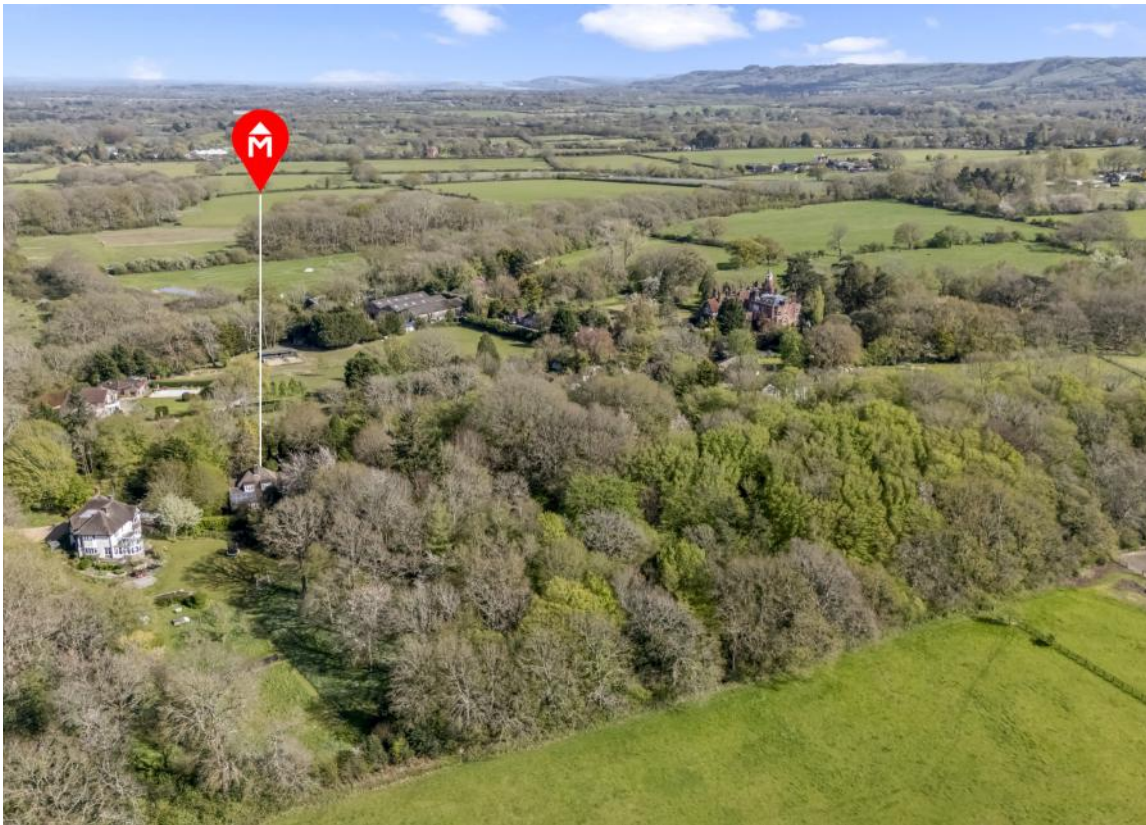
Aerial View of Wood Cottage