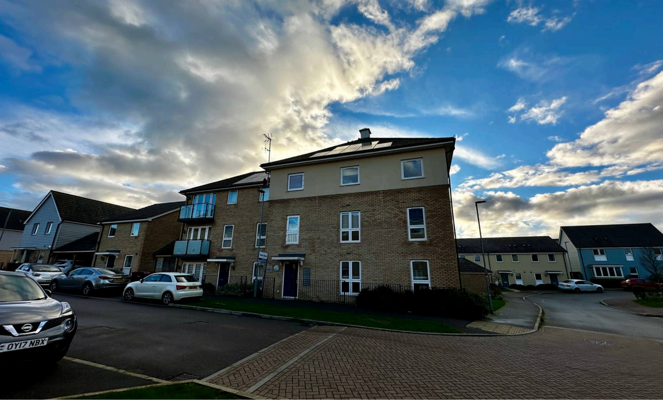
Flat 8, 19 Angus Way, Whitehouse £122,500