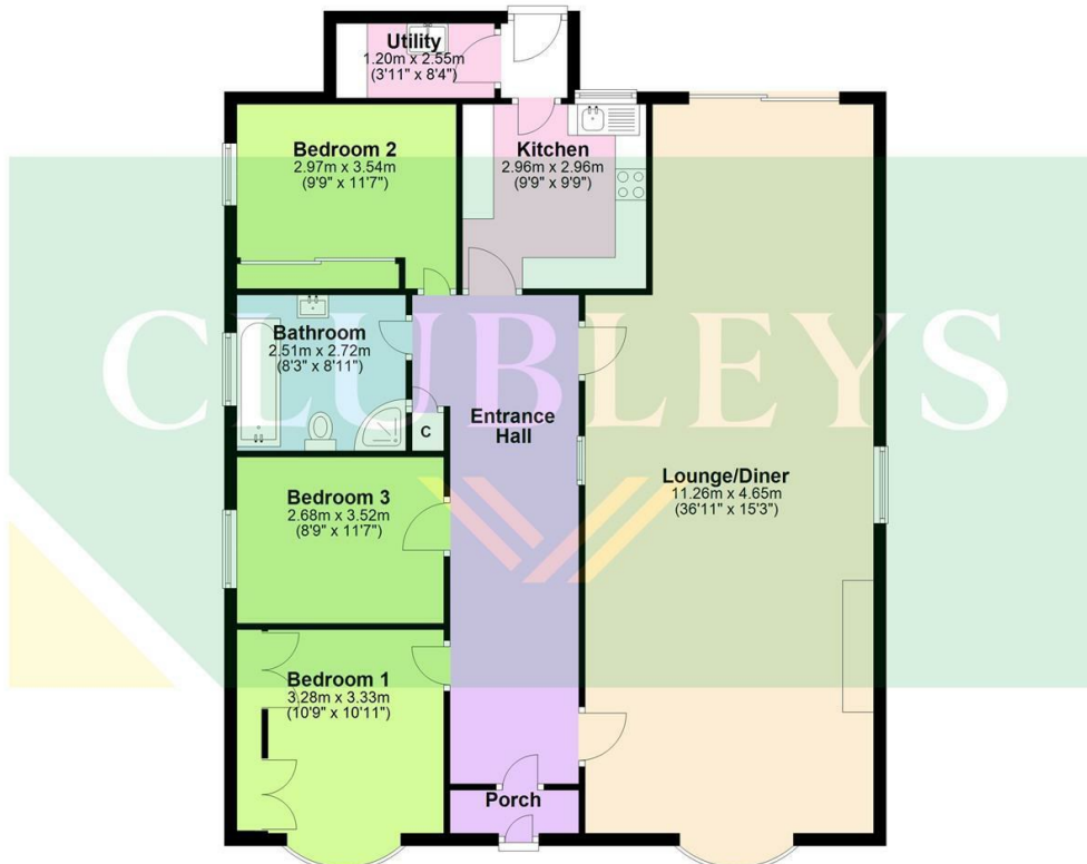
Total area: approx. 126.2 sq. metres (1358.1 sq. feet)