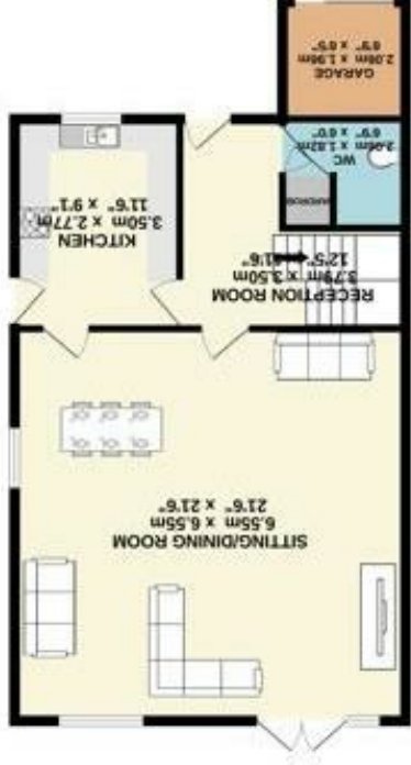
GROUND FLOOR (773 sq ft.) Approx.