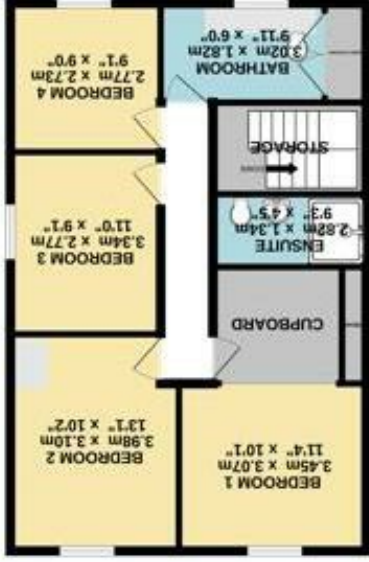
1ST FLOOR (661.9 sq ft.) (202 sq ft.) Approx.