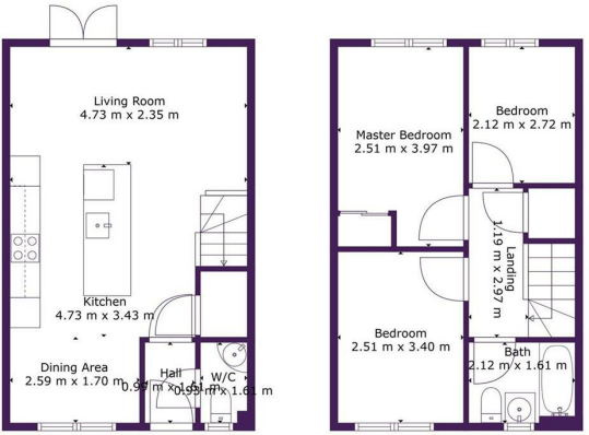
Floor 1 Floor 2