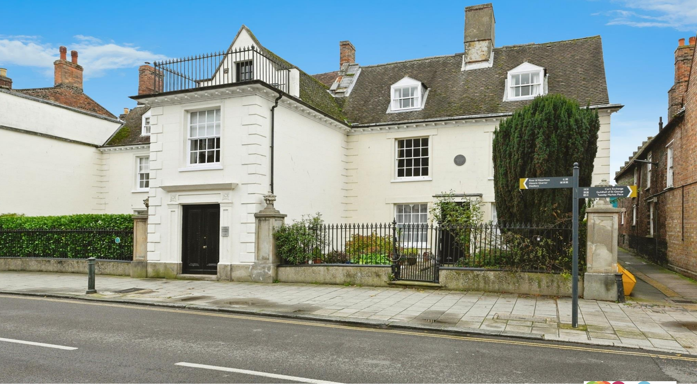
Old School Court, King's Lynn, PE30 1DB