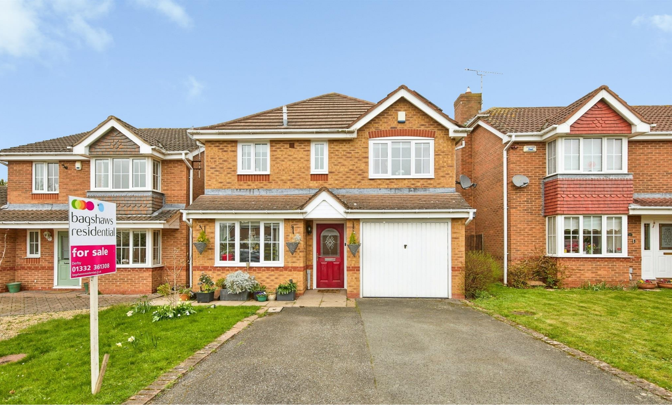
Lows Court, Chellaston Derby DE73 6NJ