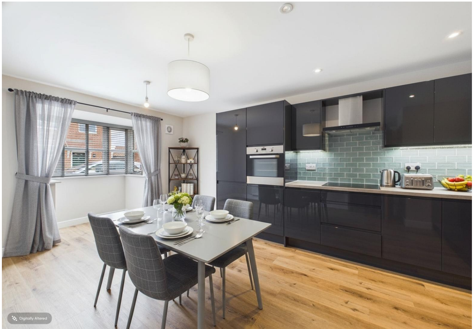
Breakfast Kitchen – VIRTUALLY STAGED