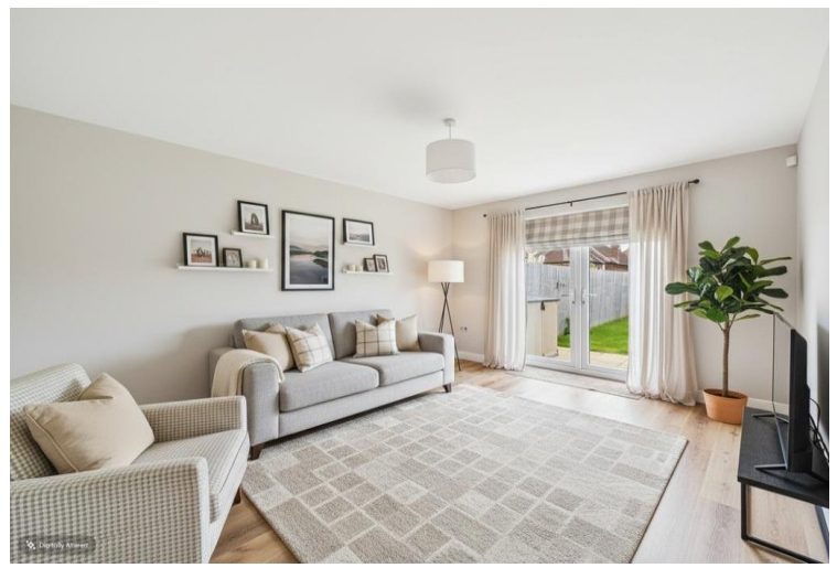
Lounge - VIRTUALLY STAGED