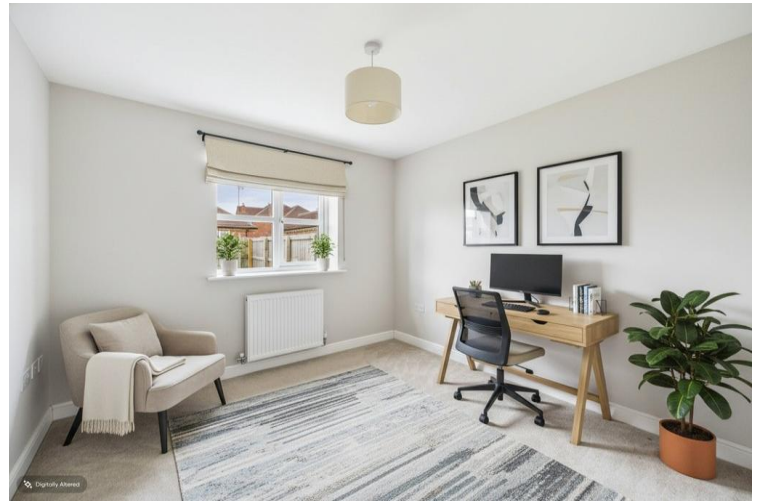
Bedroom 2 - VIRTUALLY STAGED

The cul-de-sac itself features a smart block paved road.