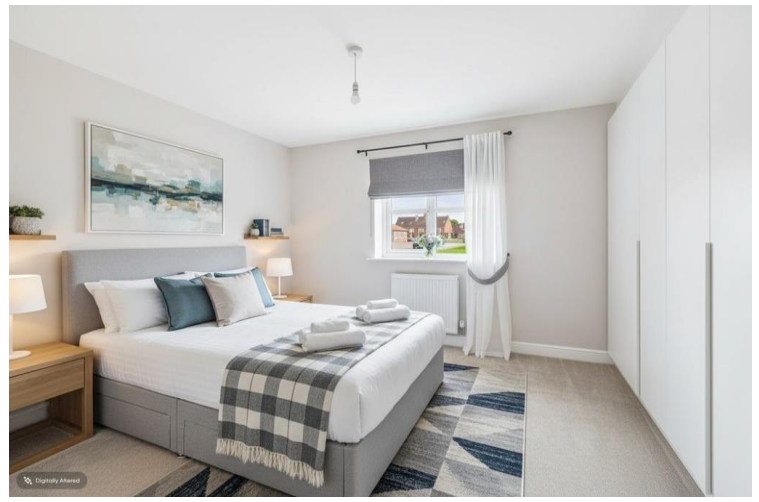
Bedroom 1 - VIRTUALLY STAGED