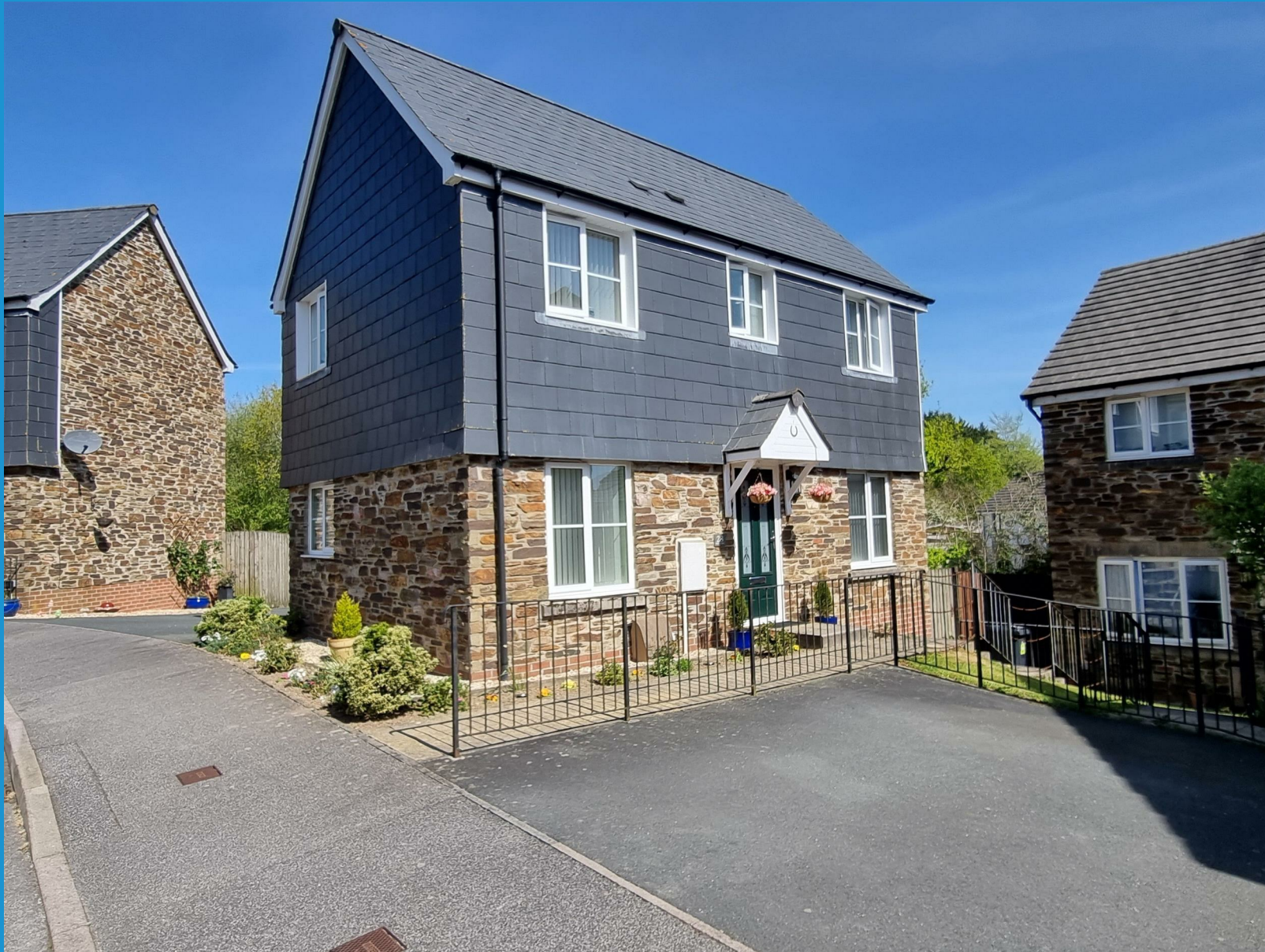
Kit Hill View Launceston | Cornwall