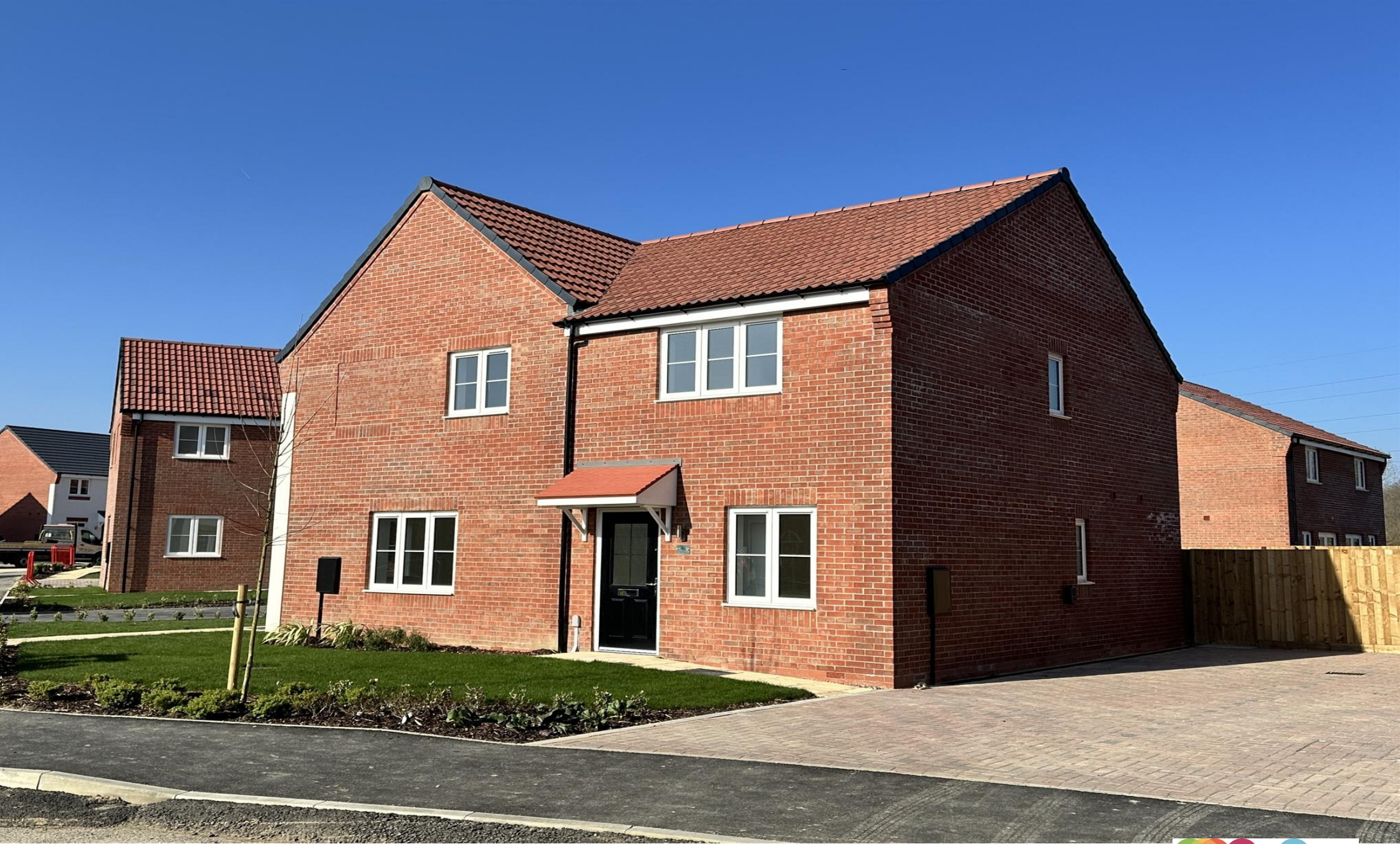
The Oak - Manthorpe Chase Manthorpe Chase, Manthorpe Grantham NG31 8FH