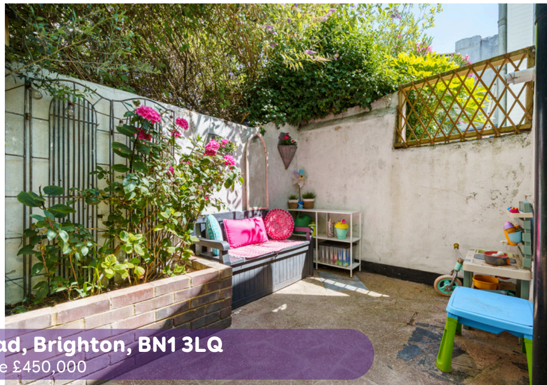
Upper Gloucester Road, Brighton, BN1 3LQ Asking Price £450,000