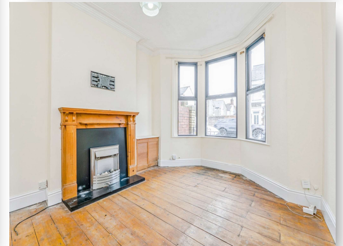
Florence Street, Splott Cardiff CF24 2PA