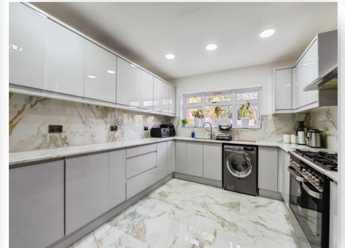
Gracedieu Road, Loughborough