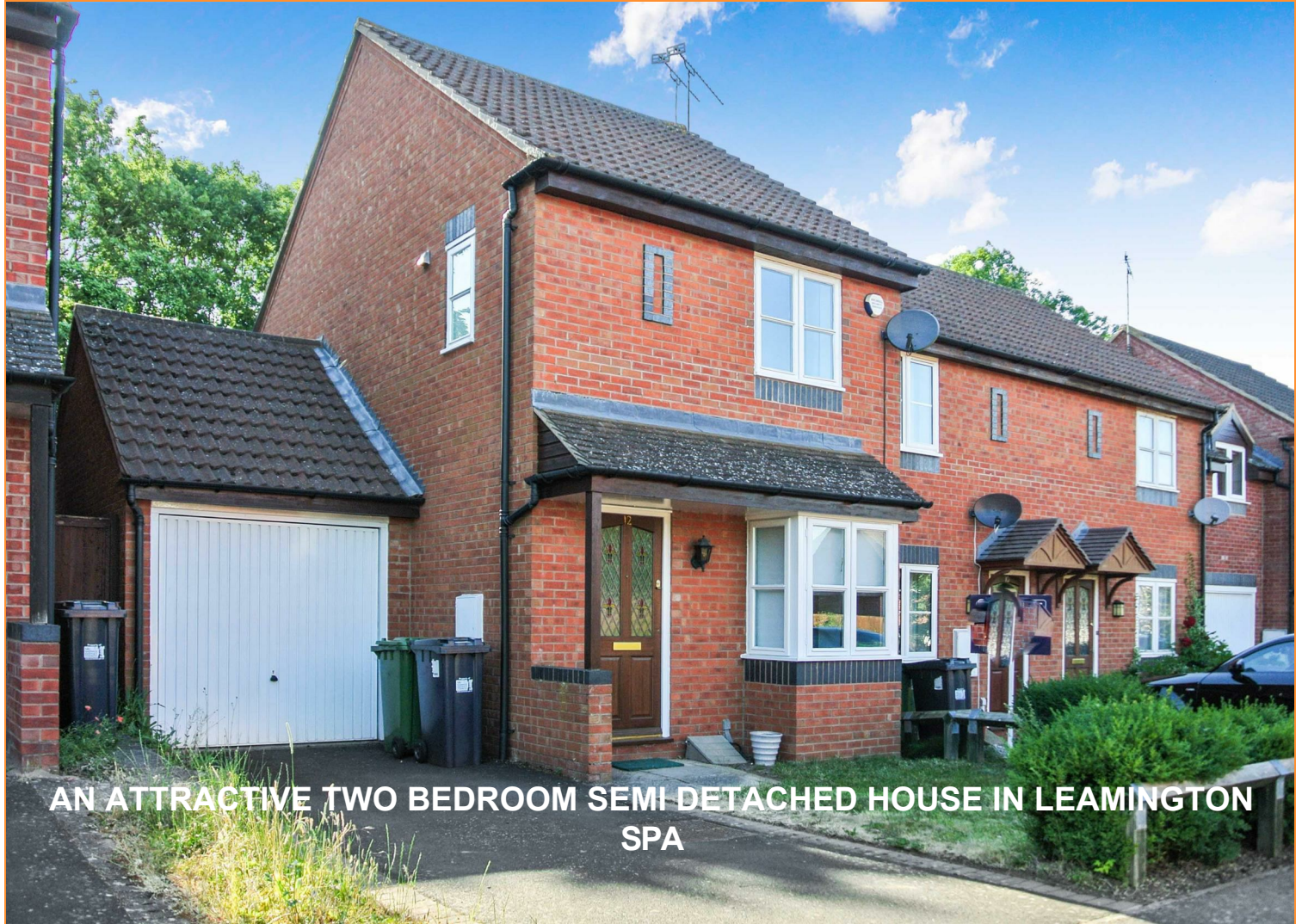
AN ATTRACTIVE TWO BEDROOM SEMI DETACHED HOUSE IN LEAMINGTON SPA