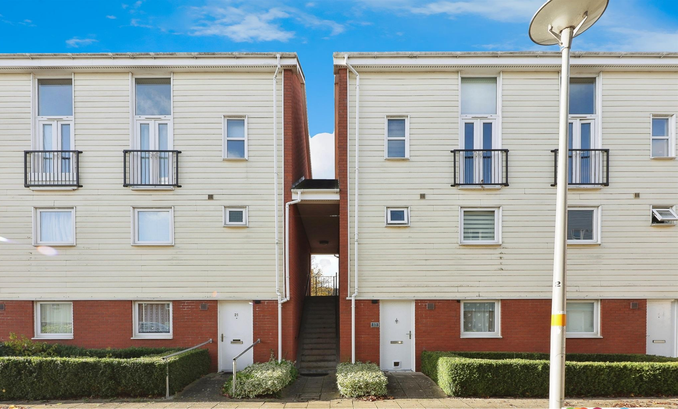
Merlin Walk, Birmingham B35 6QL