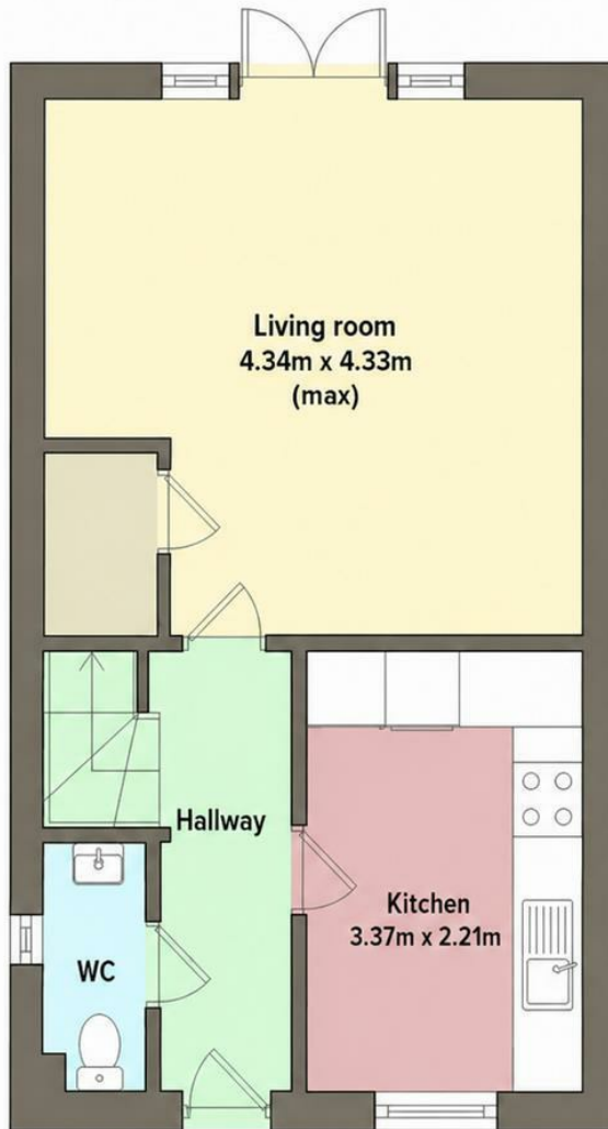
Ground floor Area: 32.39 m 2