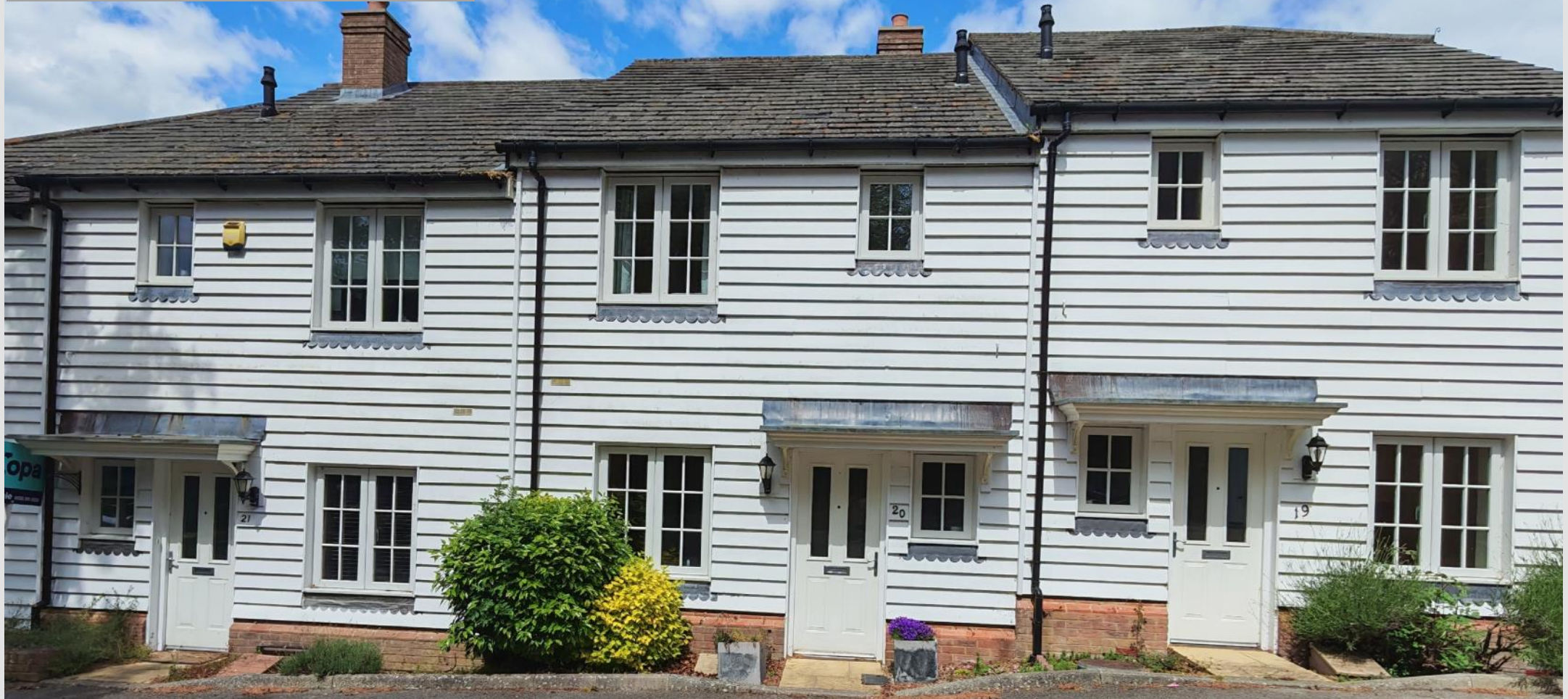
20 The Lindens, Tenterden, Kent TN30 6QT